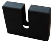
Current self cutting knives [55.0160.0007.0]