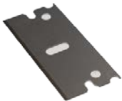
Voltage blade Protection cover [55.0180.0135.0]