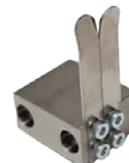
Current Blades – XL Knife [51.0160.0010.0]