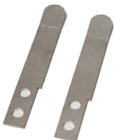
Temperature sensor [51.0120.0024.0]