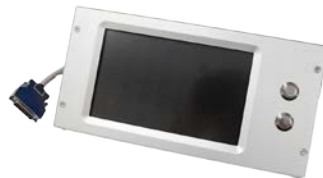
Metrological Unit MR100 [51.0030.0051.0]