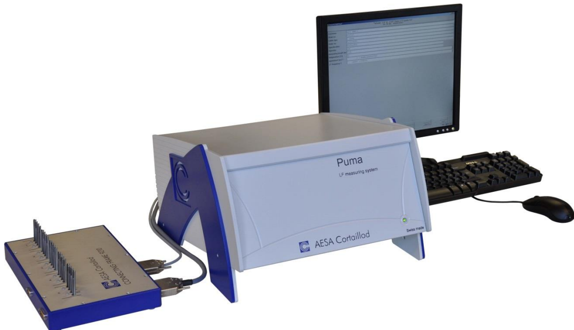
Fig 1 AESA Puma low frequency measuring system