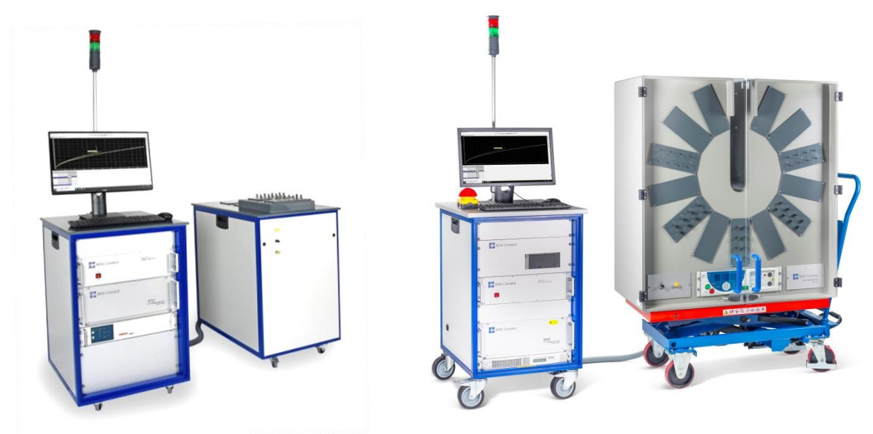
Indicative pictures: Gaia S (16 wires) & Gaia M (40 wires)

Programmable High Voltage test system combining several additional measurements (IR, LF, HF)