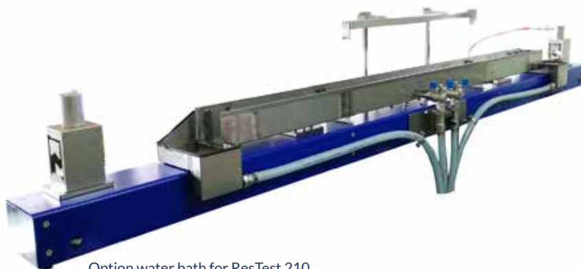
Option water bath for ResTest 210

Conductivity and Linear Resistance are intrinsically linked. Although the conductivity (inverse of resistivity) measurement is the first step of cable production monitoring, it maybe the most critical. The measurement consists of three different phases: resistance, length, and volume measurements. All the measurements are then processed by software and the result is directly computed.