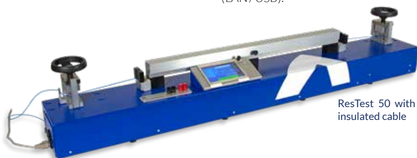
ResTest 50 with insulated cable