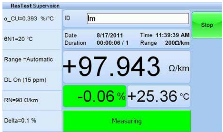
Display ResTest 50

It can also measure round or specially shaped conductors like catenary wires. It accepts a very wide range of diameters. ResTest 1 can also perform conductivity measurements (option).